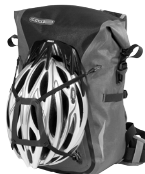
Application: helmet flap (helmet not included)